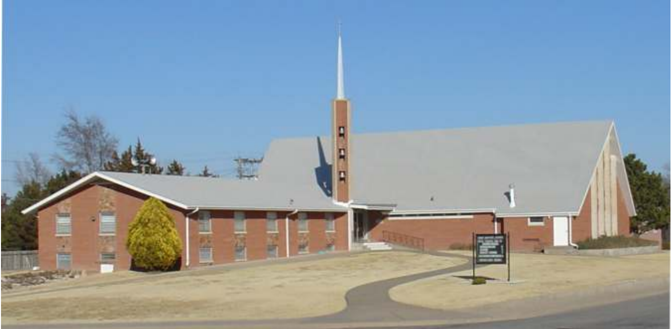
The First Baptist Church of Meade, as it stands today, in 1993.